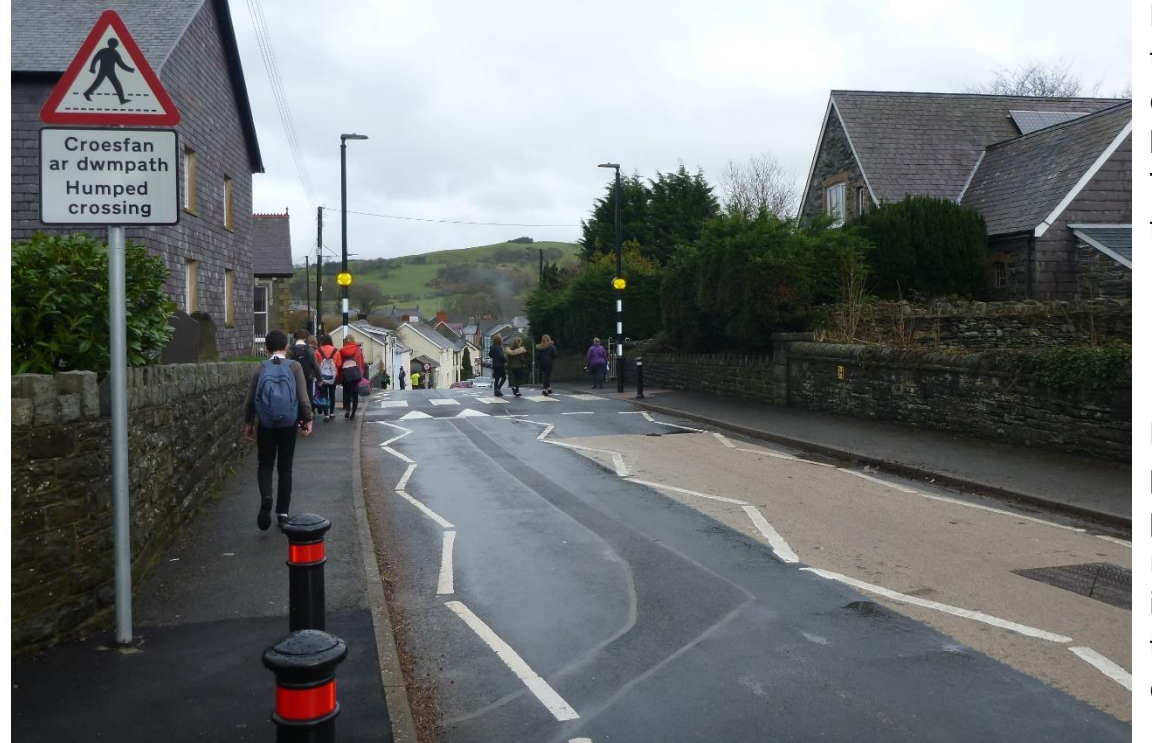
Left: New raised table zebra crossing installed between the Town Centre and the school.

New traffic calming measures were installed as part of the scheme which included a new raised table zebra crossing, alongside the introduction of new 20 mph zones and a part time 20 mph limit. Improvements at crossing points with dropped kerbs and tactile paving along with improved footways and new bollards help to provide safer routes to the school to encourage increased Active Travel journeys. The County Council re-deployed its School Crossing Patrol officer to the new school location to further ensure the safety of pedestrians accessing the school.