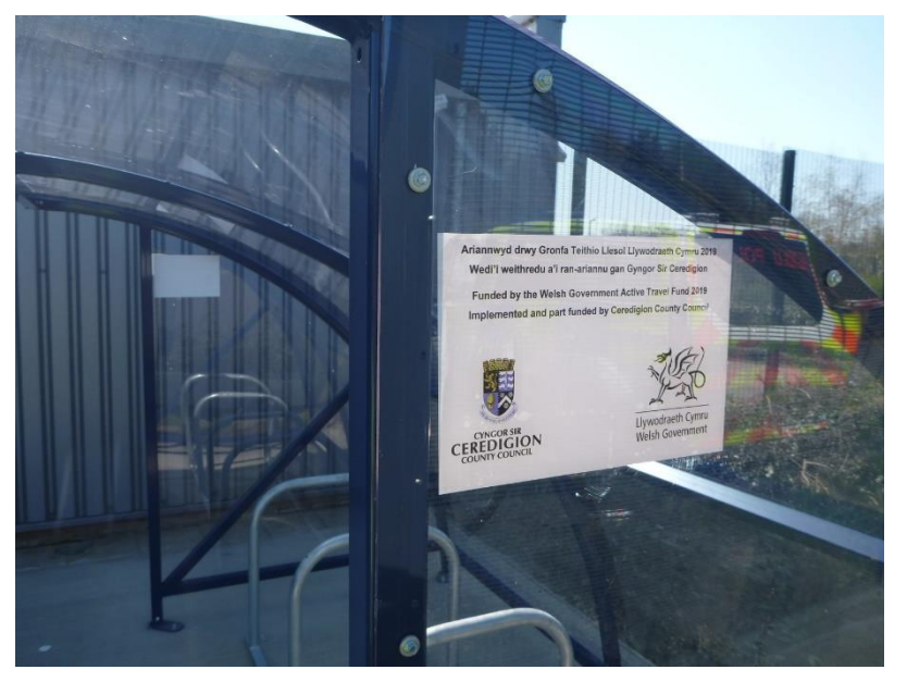
Below: 2 new cycle hoops to accommodate 4 cycles were installed on the corner of Morgan Street in Cardigan Town Centre.

Left: A new cycle shelter was installed at Cardigan Police Station in Parc Teifi Business Park in conjunction with the shared use path scheme referenced above.