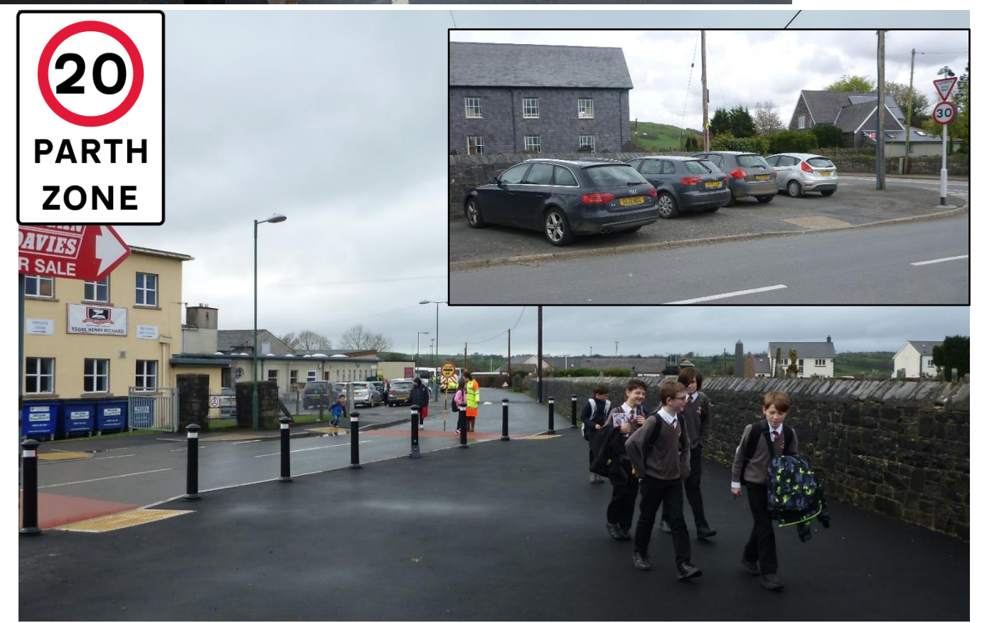
Below: Pre and post scheme photos showing road safety improvements at the school entrance.

In addition to the above snapshot of grant funded construction schemes, Ceredigion County Council has utilised the Integrated Network Map Route Development grant from Welsh Government during the 2018-19 financial year to progress proposals and scheme designs for some of the aspirational Active Travel improvements within Aberystwyth, Cardigan and Lampeter.