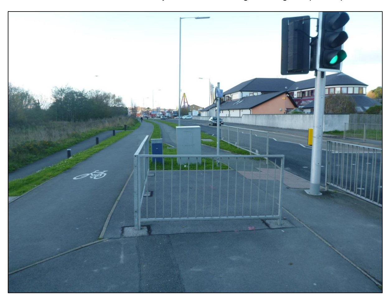
New layout with improved accessibility with 1 wide path now leading to Park Avenue.

Previous cluttered and restrictive layout at the crossing showing 2 separate paths: