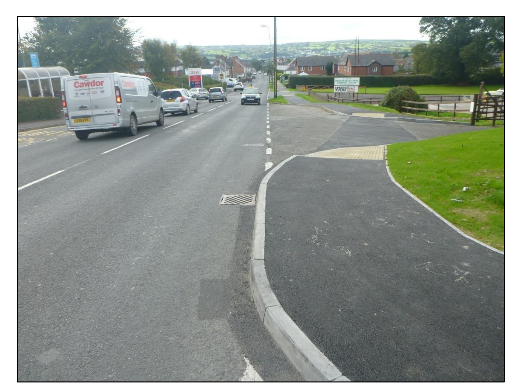
Left: New footway link installed.

The Cardigan package also included widening of the footway on Pont y Cleifion Road following an additional in-year grant award of £47,000 from the Welsh Government following early completion of the above work, thereby increasing the total package value for Cardigan to £162,000. This enabled dropped kerbs to be installed to provide an improved link for pushchair and mobility users on this route between the Town Centre and Parc Teifi Business Park.