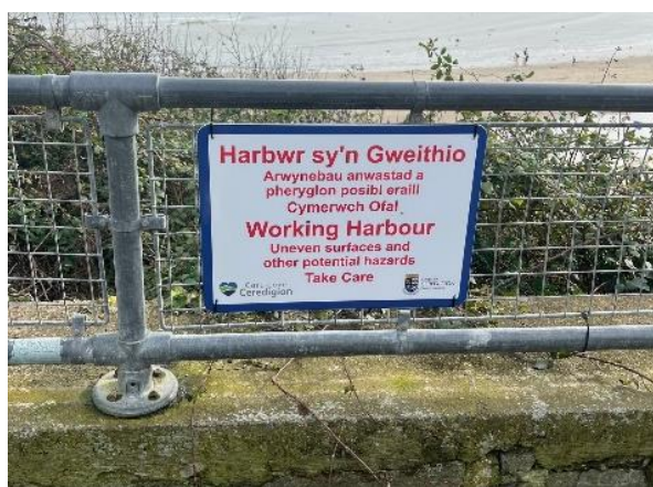
Example of in use sign at New Quay.

We are currently engaging with contractors to install signage warning members of the public and harbour users of the risks associated with accessing working harbours. The work to install signs has commenced and this work will continue into the spring.