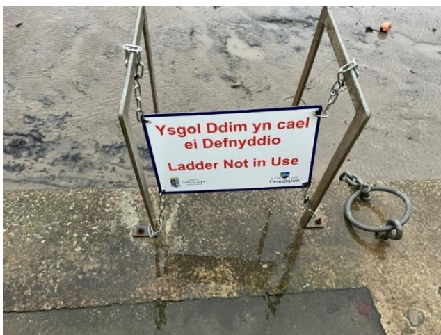
Example of in use ladder sign at Aberaeron Harbour.

Following recent inspections, several ladders in Aberystwyth and Aberaeron harbours have been identified as requiring repair. In some cases, it has been necessary to close ladders and signs have been erected identifying which ladders are not in use. We are currently undertaking a procurement exercise to engage a contract to undertake the required repairs with a view to and hope to fix re-opening all of these affected ladders at the earliest opportunity.