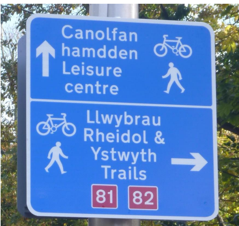
Below: New section of shared use path in front of Plascrug Leisure Centre linking to Penweddig Secondary School.