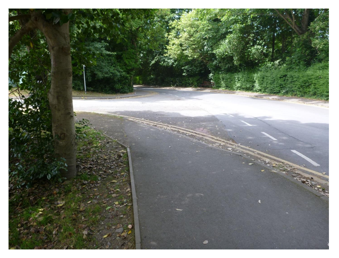
Above: Pre-scheme. Below: New raised table crossing with reduced width crossing distance and tighter junction radii. New bollards and wider shared use path with new tarmac surface.