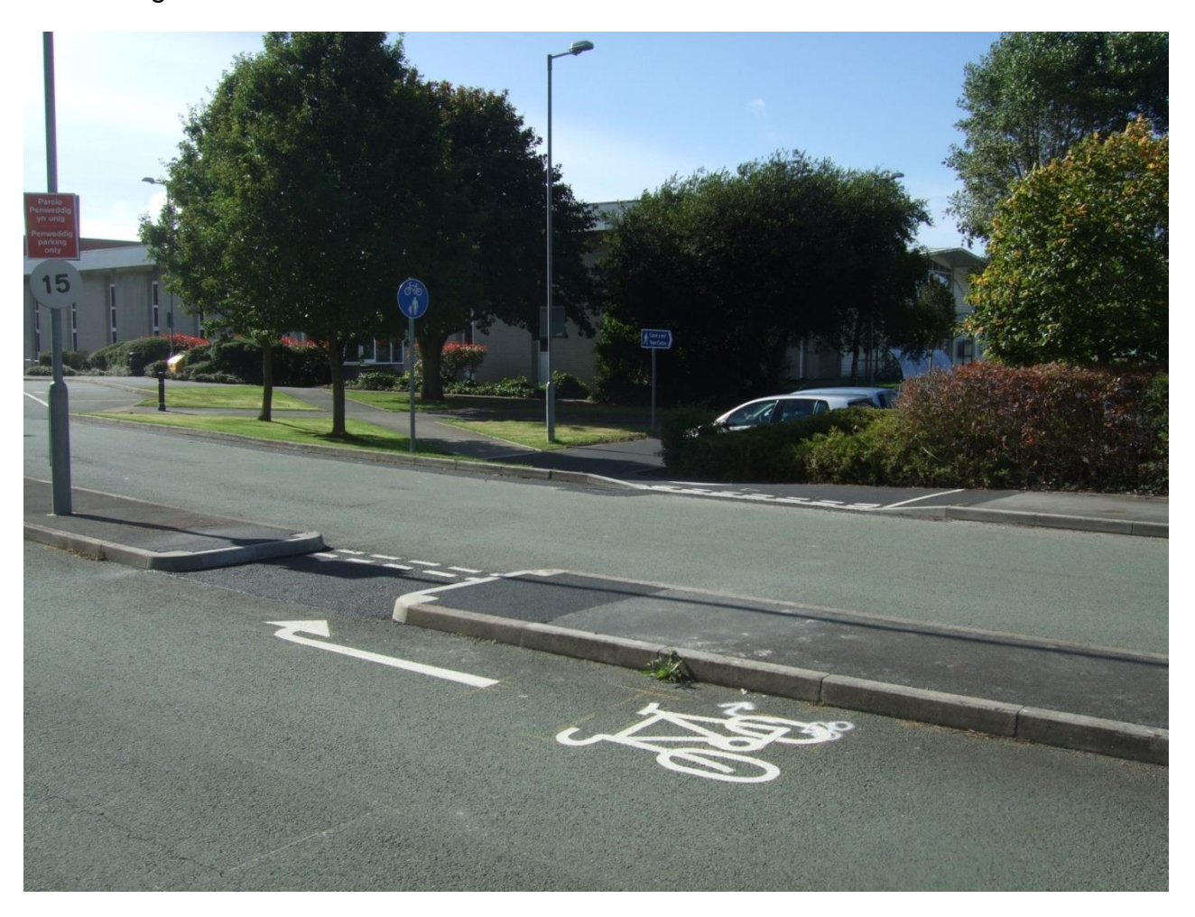
Below: Photo shows pre-scheme alignment of path with worn area of grass showing desire line.

Below: New channel created to improve access for cyclists to join new shared use path at Penweddig School.